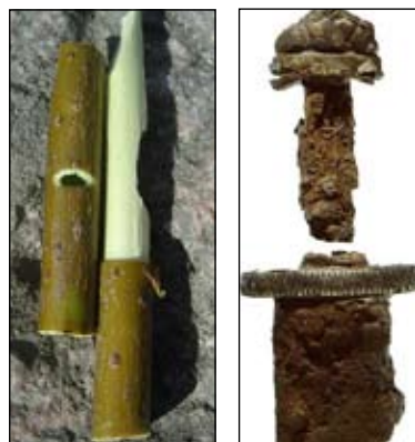
NORDIC PAST: A traditional Norwegian willow flute, left, and a Viking sword, right, from the Manx Museum

The sagas indicate that the Norse took Irish and Hebridean servants with them when colonising Iceland and Greenland – and in the Faroe Islands there is a tradition that their first set-